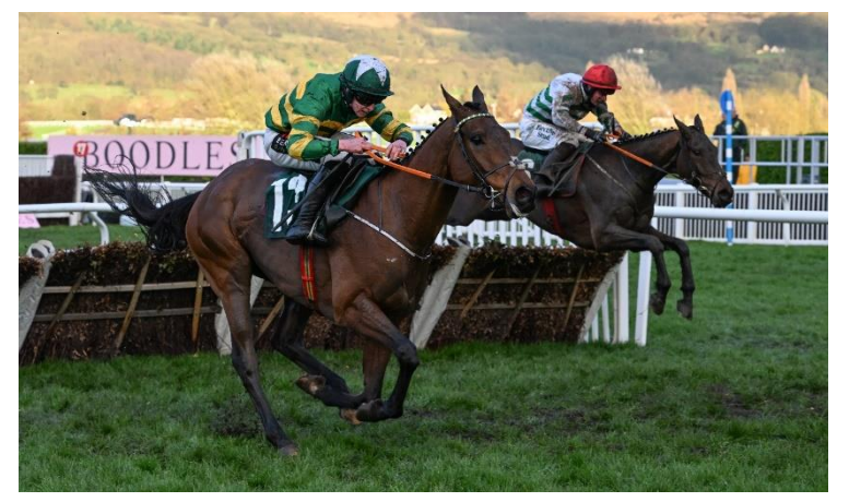
Better Days Ahead

Dancing City is rock solid. A dual Grade 1 winner over three miles over hurdles last season, he is two for two this season over fences, and there is no question about his stamina.