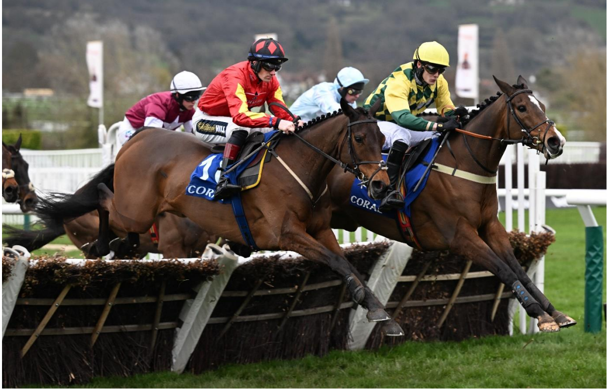
Lucky Place (near side)

The horse that I feel has the potential to progress further in today's race is Lucky Place. He put up a career best performance here at the new year fixture when winning the Relkeel Hurdle over 2m 4f. That form has a very solid look to it, with four of the horses that finished behind Lucky Place subsequently going on to run well. It was the manner of Lucky Place's success that also impressed me. He was in a battle with a strong stayer in Gowel Road, but kept on well up the finishing hill to beat that rival. He could just be the horse to take a big step forward for today's test. At the time of writing odds of 8/1 appear fair.